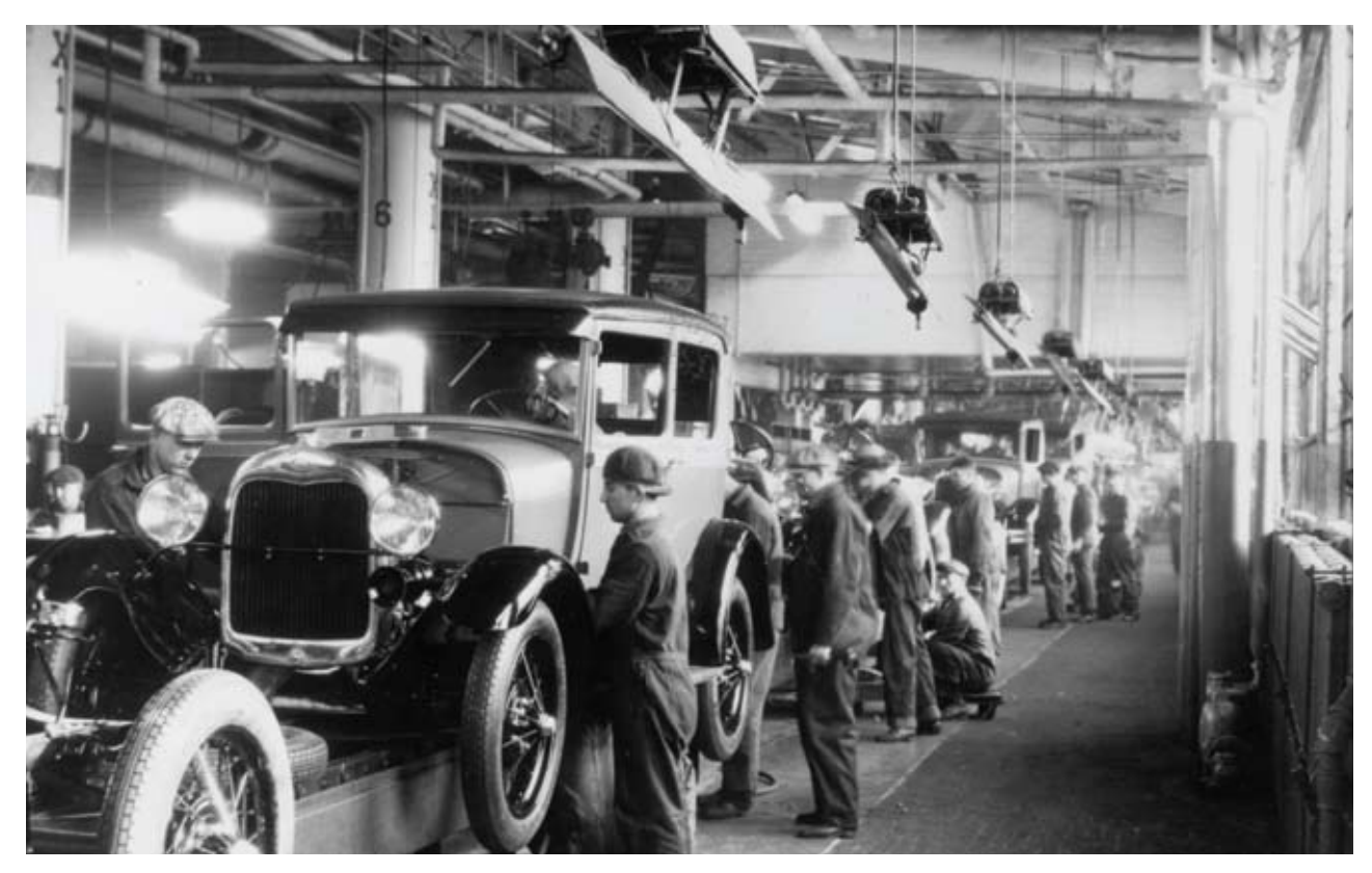
A Ford assembly line in 1928. America once led the world in automobile manufacturing, but 80 years after this picture was taken the industry nearly collapsed due to poor management and a weak economy.