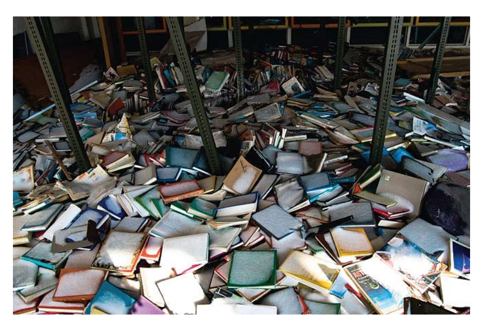
Snow covers books in an abandoned and vandalized Detroit public school. The decline of manufacturing in places like Detroit has been accompanied by rampant crime and social decay.

countries supplying said goods might oppose U.S. diplomatic or military goals, creating the danger that access to vital items could be used for political leverage by foreign governments or even cut off in a national emergency.