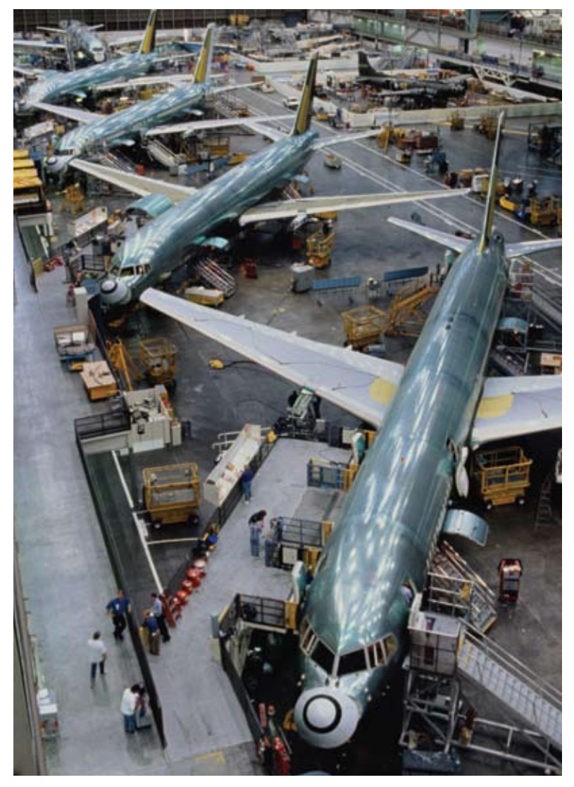
A Boeing assembly line. Aerospace is one of the few high-tech areas where America is still a global leader in manufacturing.

However, the first decade of the new millennium presented a starkly different situation. It began with a stock market sell-off as the dot.com boom went bust, and that was followed by the shock of terrorist attacks on 9-11. The administration of George W. Bush cut interest rates and taxes in an effort to revive the economy while greatly increasing defense outlays to conduct a "global war on terror." This combination of policies initially seemed to have a strong stimulative effect on economic activity, but after a few years of moderate growth the economy weakened again in response to the sub-prime mortgage crisis. By the time Bush left office, the trade deficit had doubled to nearly $800 billion annually, the national debt had doubled to over $10 trillion, and the manufacturing sector was in rapid decline. Against this backdrop, the nation elected a new president more inclined to use the power of government to reshape the economy. As President Obama's budget message to Congress put it, "Investing in the future has been critical to long-term economic growth and creating high-paying jobs for our people throughout our history." Obama left little doubt that while he was in the White House, government would take a leading role in making such investments.