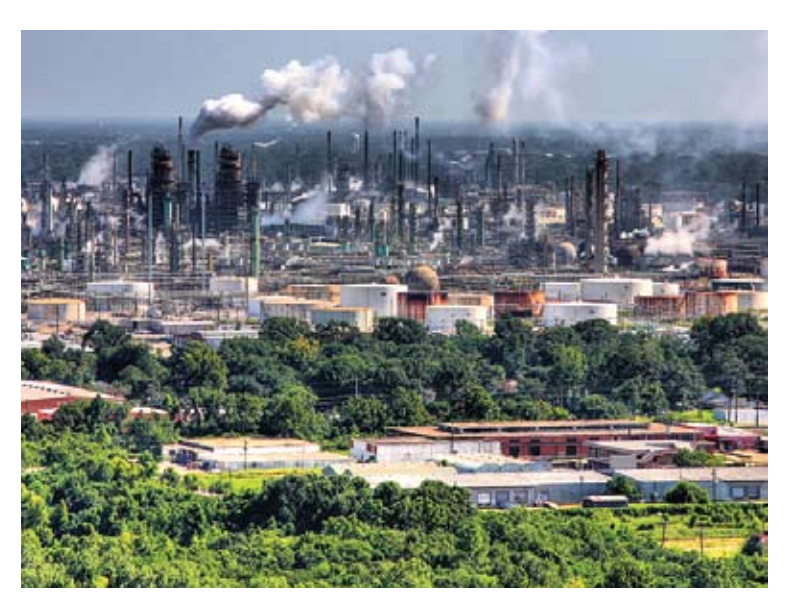
An oil refinery in Baton Rouge, Louisiana. No new refineries have been built in the United States in the last 30 years.

The U.S. commercial shipbuilding industry collapsed following the elimination of federal construction subsidies in the 1980s. As a result, the world's biggest trading nation no longer produces tankers and freighters for use on international routes. Its shipbuilders have become dependent on business with the U.S. Navy and Coast Guard, supplemented by orders from companies operating in the protected domestic market.