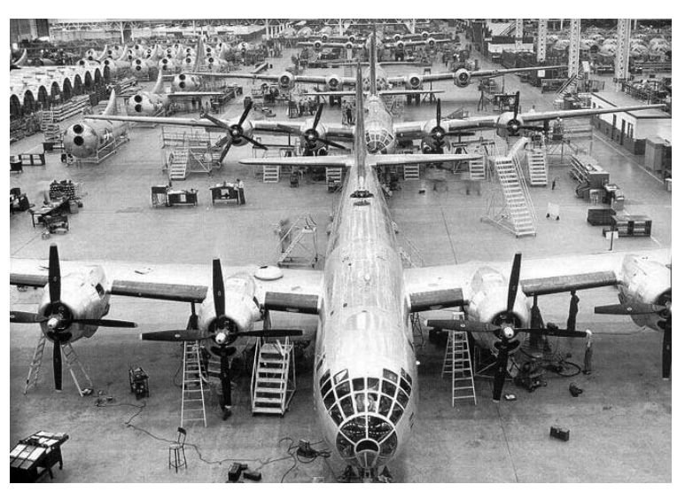
A B-29 bomber plant during World War Two. Much of the weapons production during the war was carried out in converted commercial plants.

billion to the purchase of new equipment in fiscal 2010, with many additional billions set aside for the maintenance and modification of equipment already in the force. Further equipment outlays were contained in the budget requests for the Department of Homeland Security (which manages the Coast Guard) and the Department of Energy (which manages nuclear weapons programs). When all of the administration's proposed security expenditures with potential to generate industrial demand are added together, they total over a quarter of a trillion dollars per year.