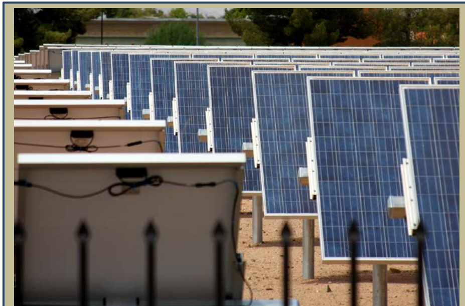
Solar energy has the lowest demand and stress on the water supply.

Solar energy has the lowest demand and stress on the water supply, which makes it an easy go-to alternative source of energy during chronic droughts. However, investors and supporters of solar also need to consider the benefits of this energy source along with its cradle-to-grave life cycle assessment. The full-circle assessment examines the environmental impact of materials needed to create the solar panel, the actual life-cycle and the disposal impact of the materials once its usefulness has expired. The average life cycle for solar panels is about 25 years.