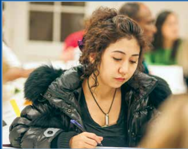
Alexandria, Virginia's Campagna Center serves over 200 adult English learners a year.

Campagna's theory is that parents are the first and most important language teachers to their children. Little or no English at home severely hinders a child's ability to make linguistic progress at school.