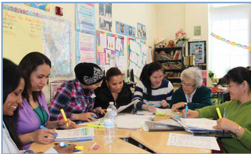
Strong neighborhood involvement aids adult charter school Carlos Rosario's staff, here leading small group sessions.

Responsible charter school governance requires establishing strong accountability for results, making it an attractive approach to handling the unique challenges of this sector. But very few jurisdictions nationally have charter school laws and funding streams that allow adult education charters. The District of Columbia's School Reform Act explicitly permits the establishment of “adult, community, continuing and vocational education programs.” 33 Carlos Rosario was accredited by the Middle States Commission in 2005.