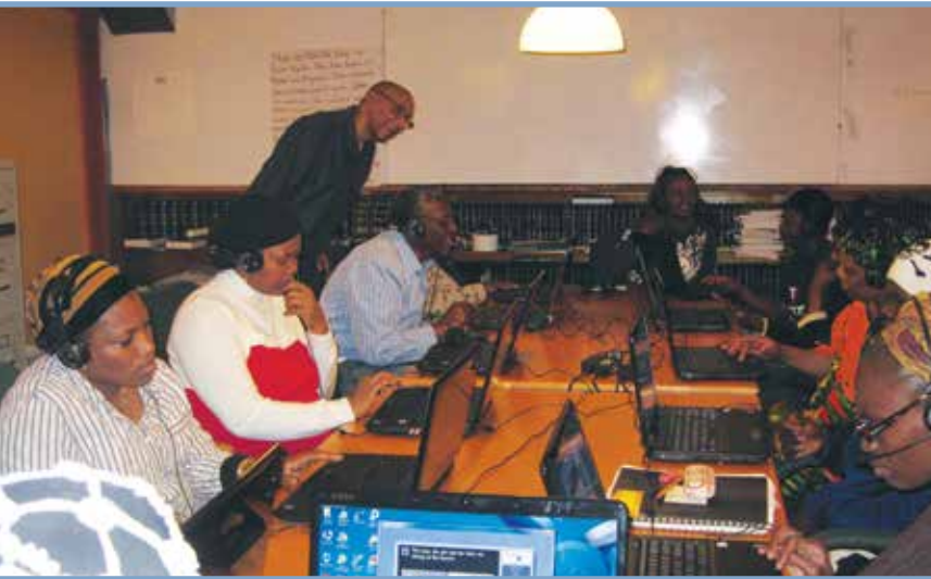
Harlem's African Service Committee tackles its biggest challenge, English literacy, using technology.