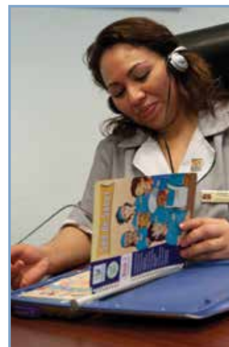
Marriott International's Sed de Saber program allows ESL employees to learn at their own pace and place of their choosing.

The Building Skills Partnership (BSP), founded in 1994 and based in California, is a collaboration between the Service Employees International Union (SEIU) and corporate partners including those that employ janitorial workers like Google and commercial building owners. 40 The BSP offers two types of ESL instruction to accommodate many low-wage workers and help them advance in their careers. One program offers 3-month block classes on a 'learner-centered' basis at union halls in the San Francisco Bay Area and Los Angeles regions. The second program, ADVANCE Workplace ESL and Job Skills, teaches employees at their worksite – before and after their shifts. Employers help defray the costs of the site-based programs because they focus on workplace English. The program benefits employers since their employees have improved customer interactions, work rules compliance and enhanced job skills. 41 For janitors at Google, completing the program (which 95% of participants do) means they can transition from the night shift to the day shift and earn higher wages. Google employees participate as tutors, since they are already on-site, there's a minimal time and transportation barrier to volunteering. Furthermore, janitor and other low wage earner participants can use up to a half-hour per shift to learn English on the job – making it easier for them to make the commitment to the program. 42