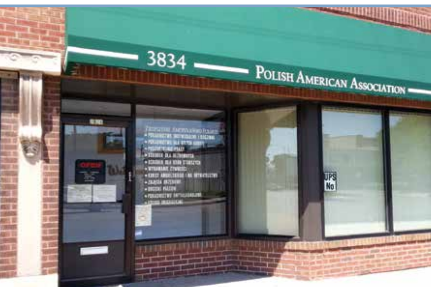
Chicago's Polish American Association offers ESL classes seven days a week.