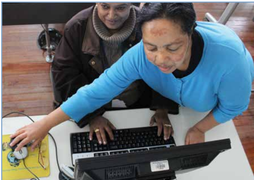
Washington, DC's Carlos Rosario International Public Charter School offers workforce training and computer literacy as students progress toward English proficiency.