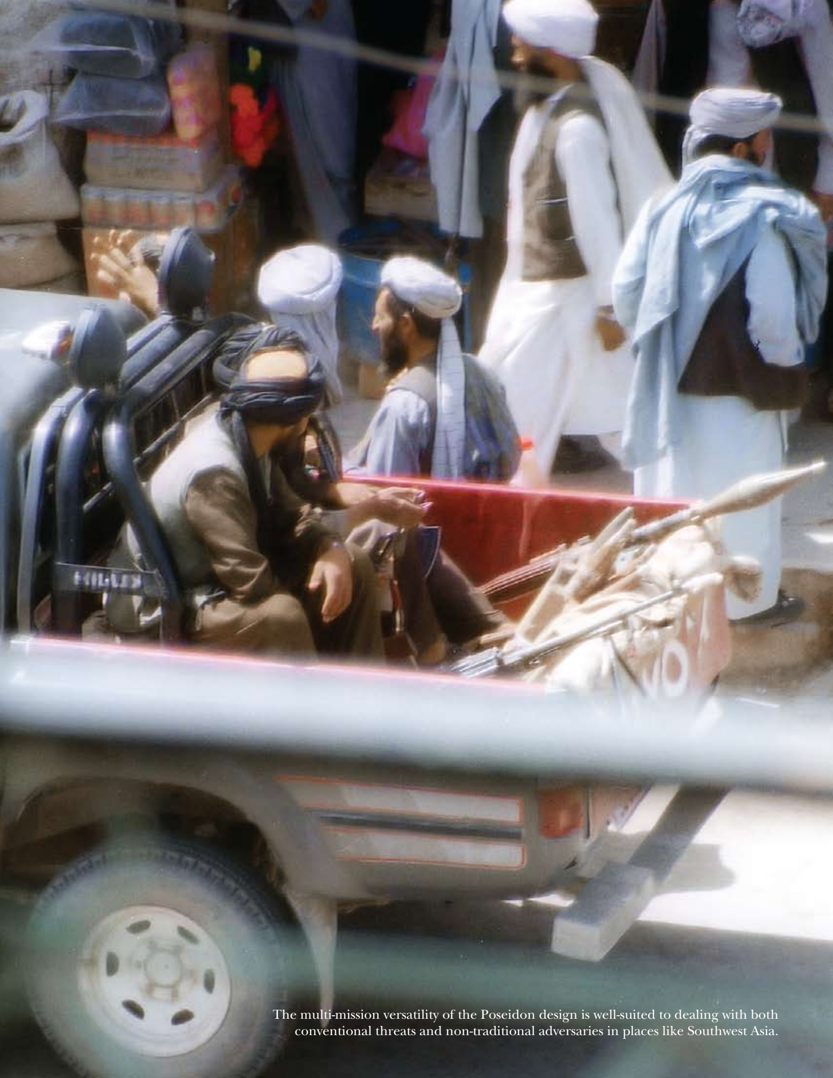
The multi-mission versatility of the Poseidon design is well-suited to dealing with both conventional threats and non-traditional adversaries in places like Southwest Asia.