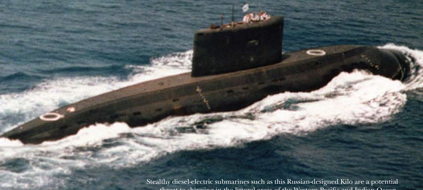
Stealthy diesel-electric submarines such as this Russian-designed Kilo are a potential threat to shipping in the littoral areas of the Western Pacific and Indian Ocean.