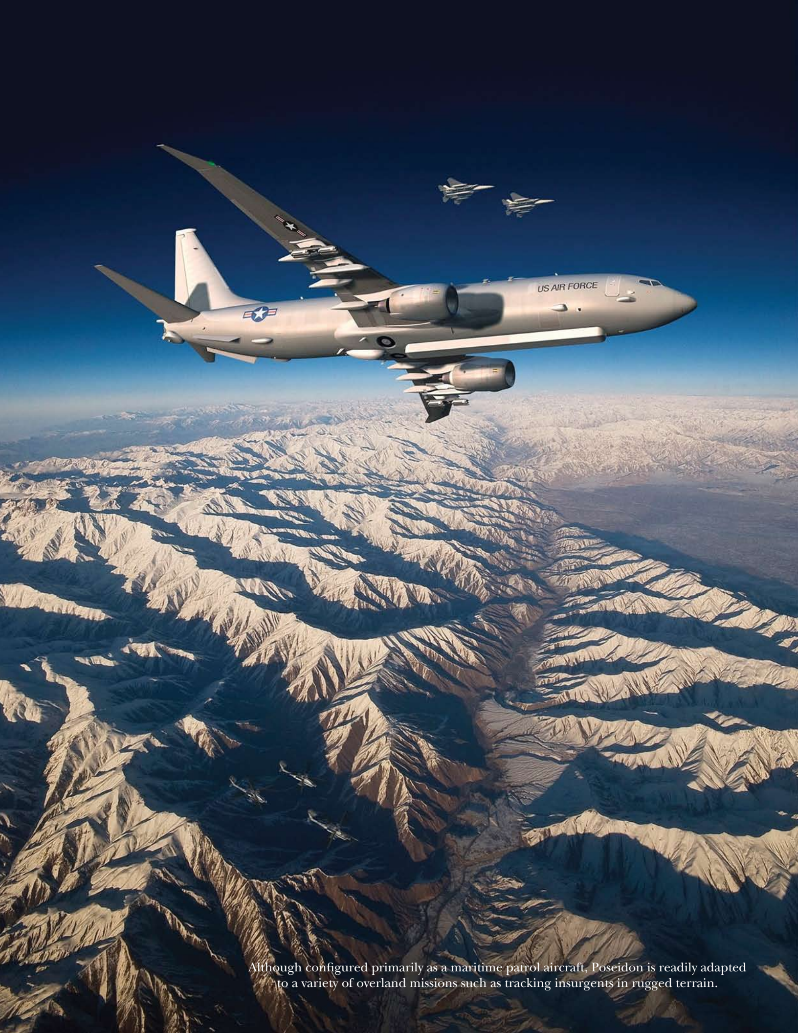
Although configured primarily as a maritime patrol aircraft, Poseidon is readily adapted to a variety of overland missions such as tracking insurgents in rugged terrain.