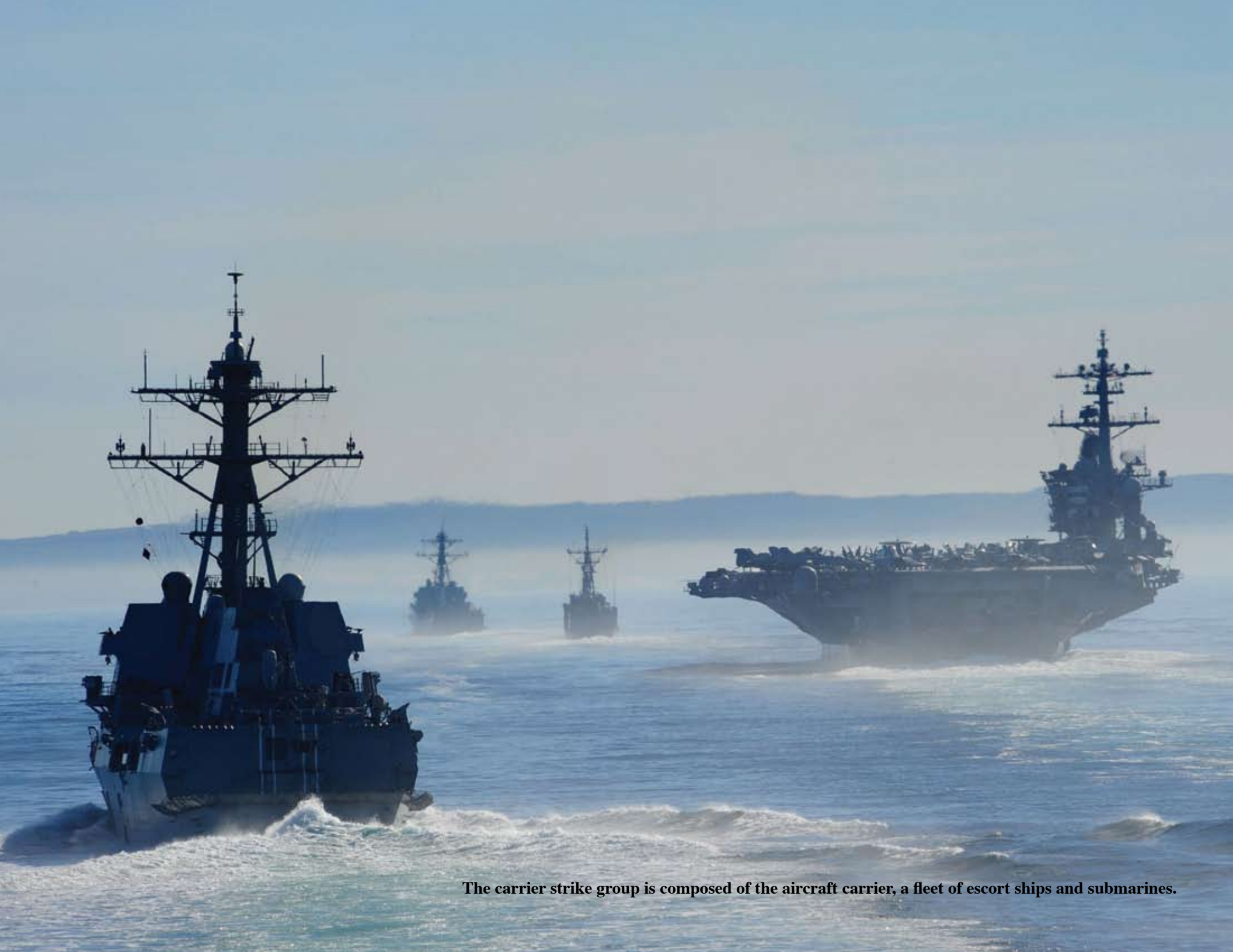
The carrier strike group is composed of the aircraft carrier, a fleet of escort ships and submarines.