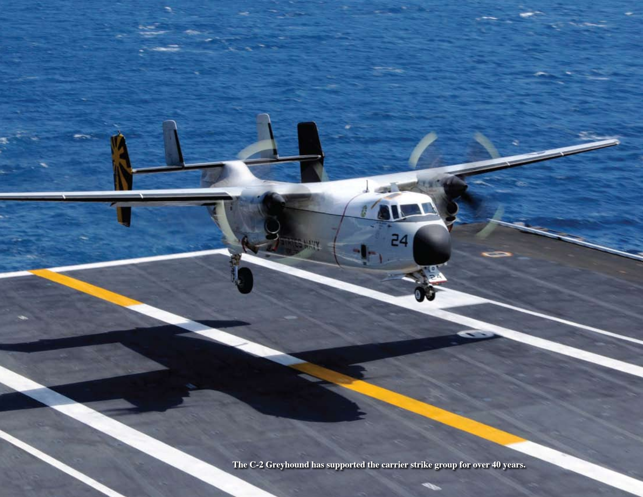
The C-2 Greyhound has supported the carrier strike group for over 40 years.