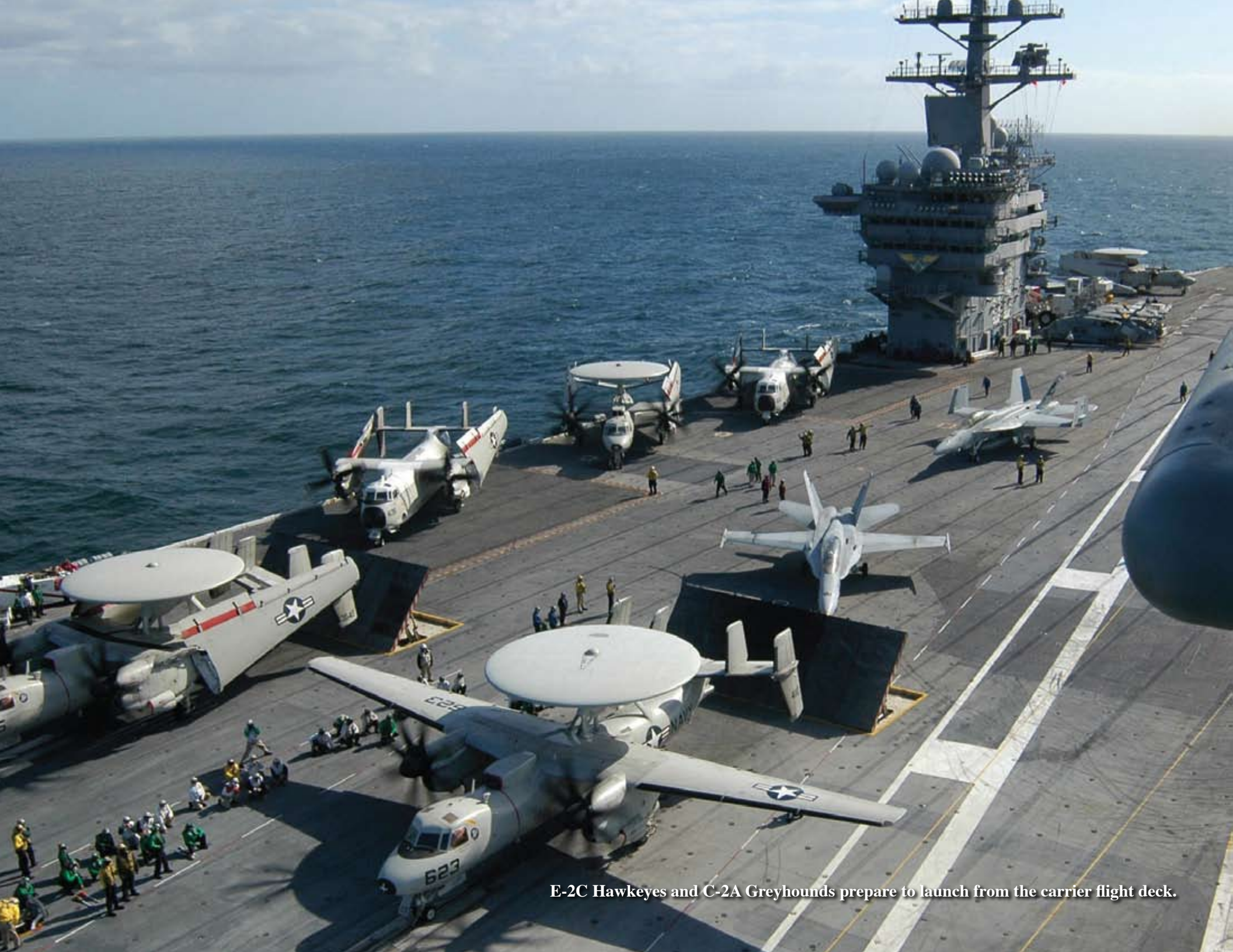
E-2C Hawkeyes and C-2A Greyhounds prepare to launch from the carrier flight deck.