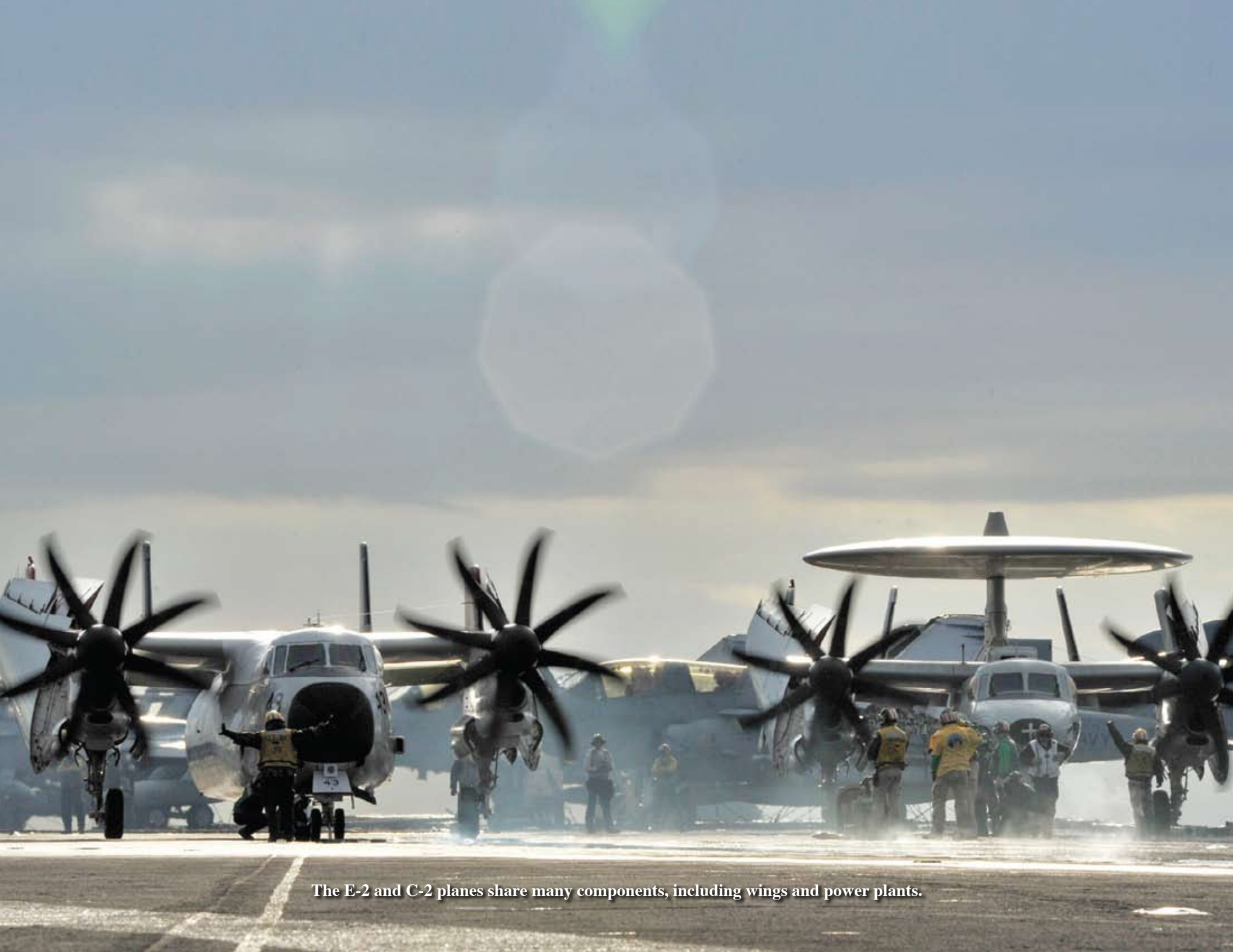
The E-2 and C-2 planes share many components, including wings and power plants.